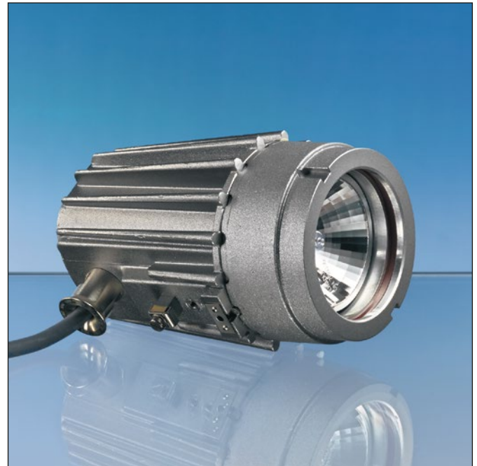
Lumistar luminaire USL 06