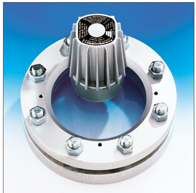
Application as combined light/sight port, fitted to a circular sight glass assembly to DIN 28120; fastened with hinged bracket