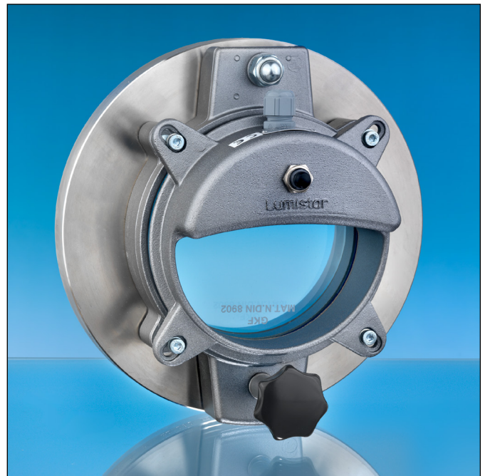
Lumiglas light sight glass fitting ESKS